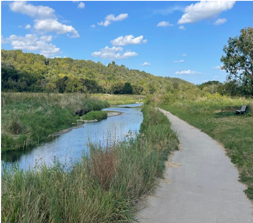
Site 2- Anglers can get close to some very nice trout habitat at this fishing access site. From the gravel parking lot, anglers must travel about 0.2 miles on the paved Trout Run Trail to access this site. This portion of Trout Run Trail follows the stream and does not contain any large hills.