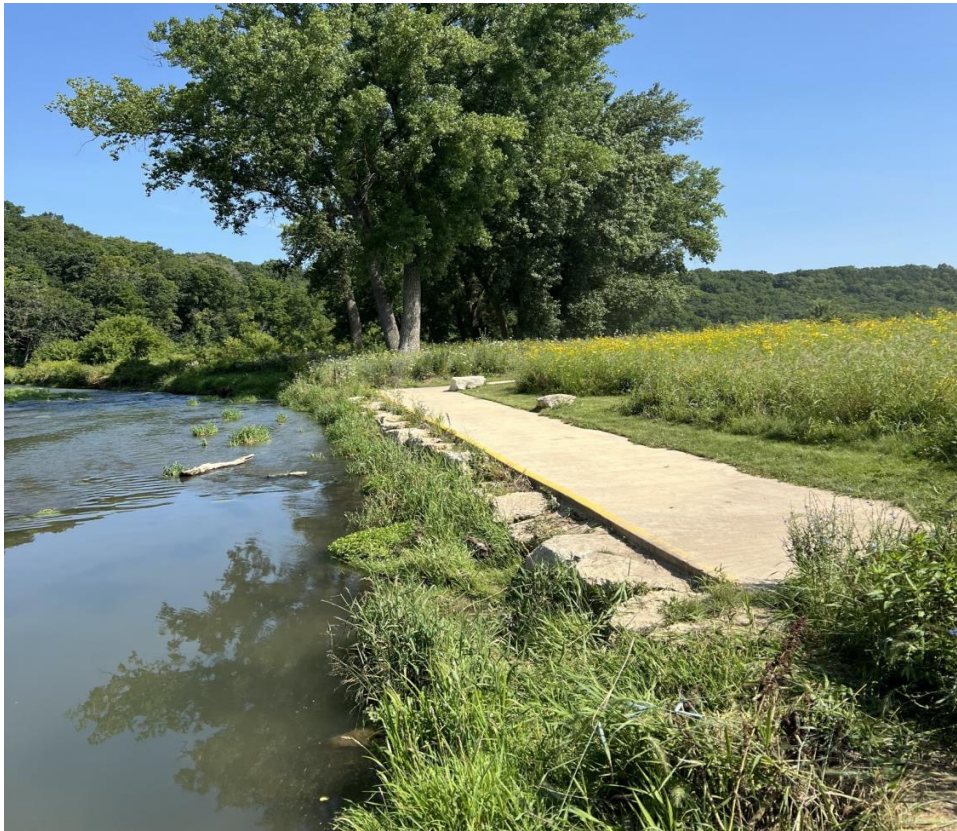
Site 1- Sixty feet of paved walkway connects this fishing access site to Trout Run Trail and the gravel parking area.