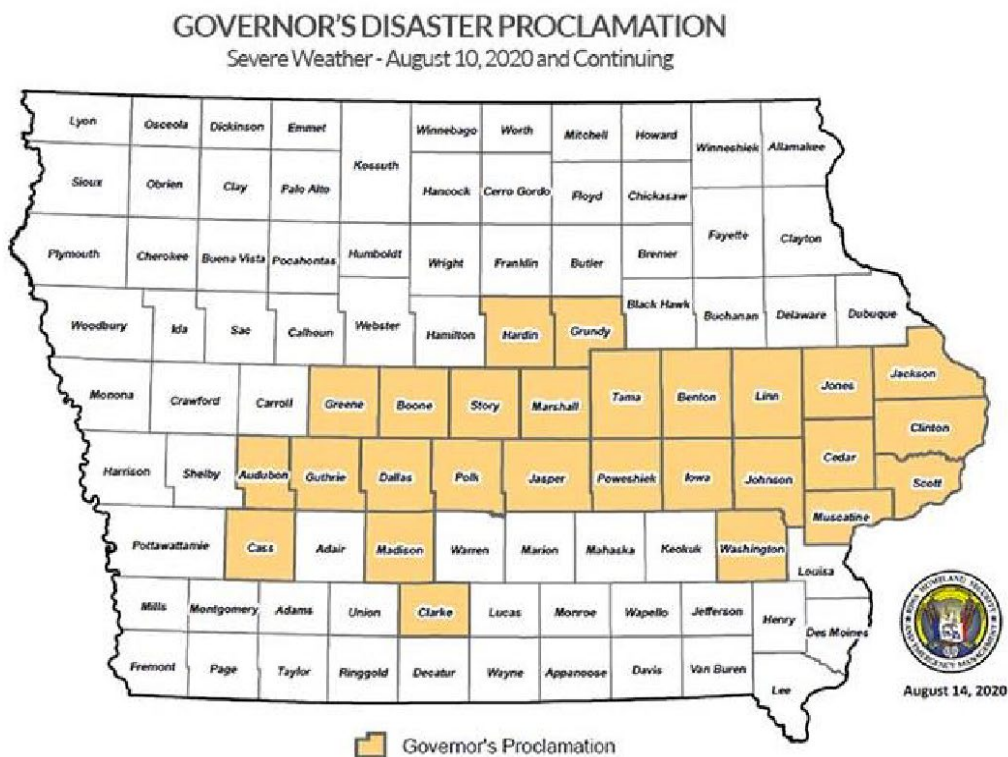
Figure 2. Map of Governor’s Disaster Proclamation for Severe Weather on August 10, 2020

Applications were made available December 4, and accepted until March 1, 2024. Per state code, a team of DNR Forestry staff reviewed and scored each application. Award recipients were announced on March 22, 2024 and approximately $97,191.53 was allocated using Derecho funds. An additional $5,283.88 was awarded, and paid from residual SUFR funds. In Fall of 2024, an additional round of applications was accepted to allocate $159,756.96 of unspent funding. Fall award recipients were announced on September 6, 2024.