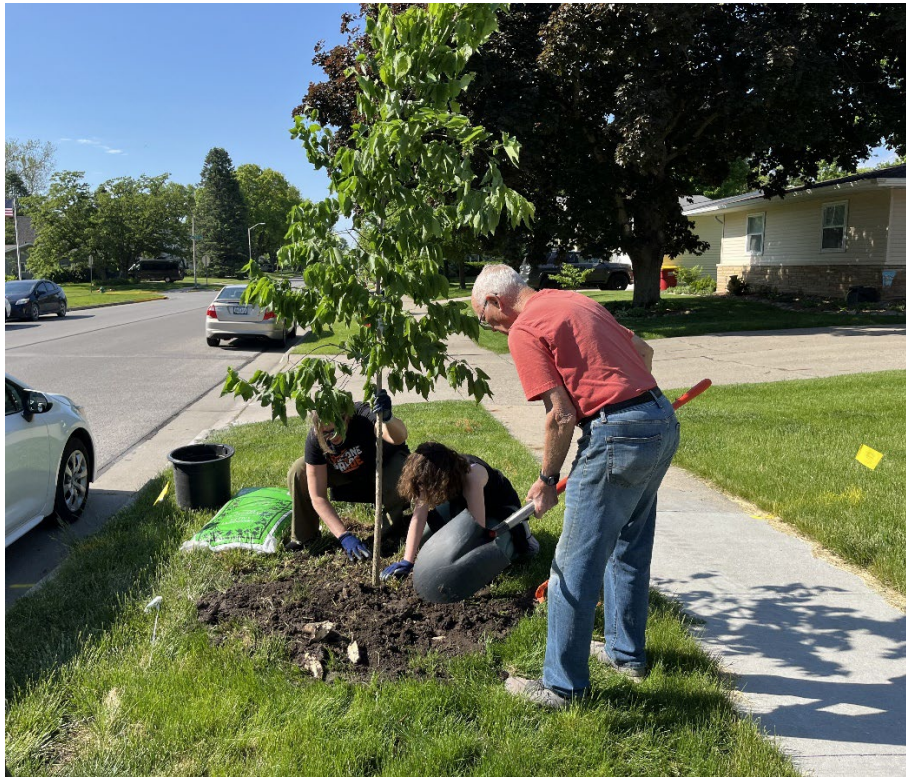
Figure 4. Volunteers planting a tree during the Ames Community Forestry Grant Program planting event in Fall 2024.