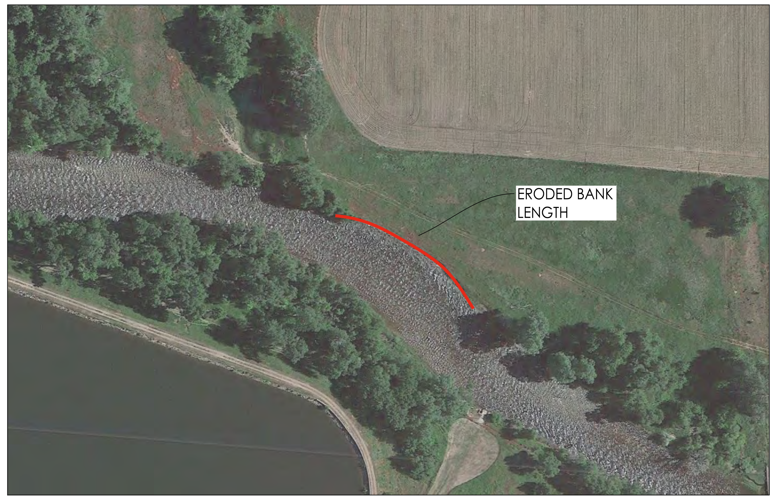
2014 AERIAL IMAGE