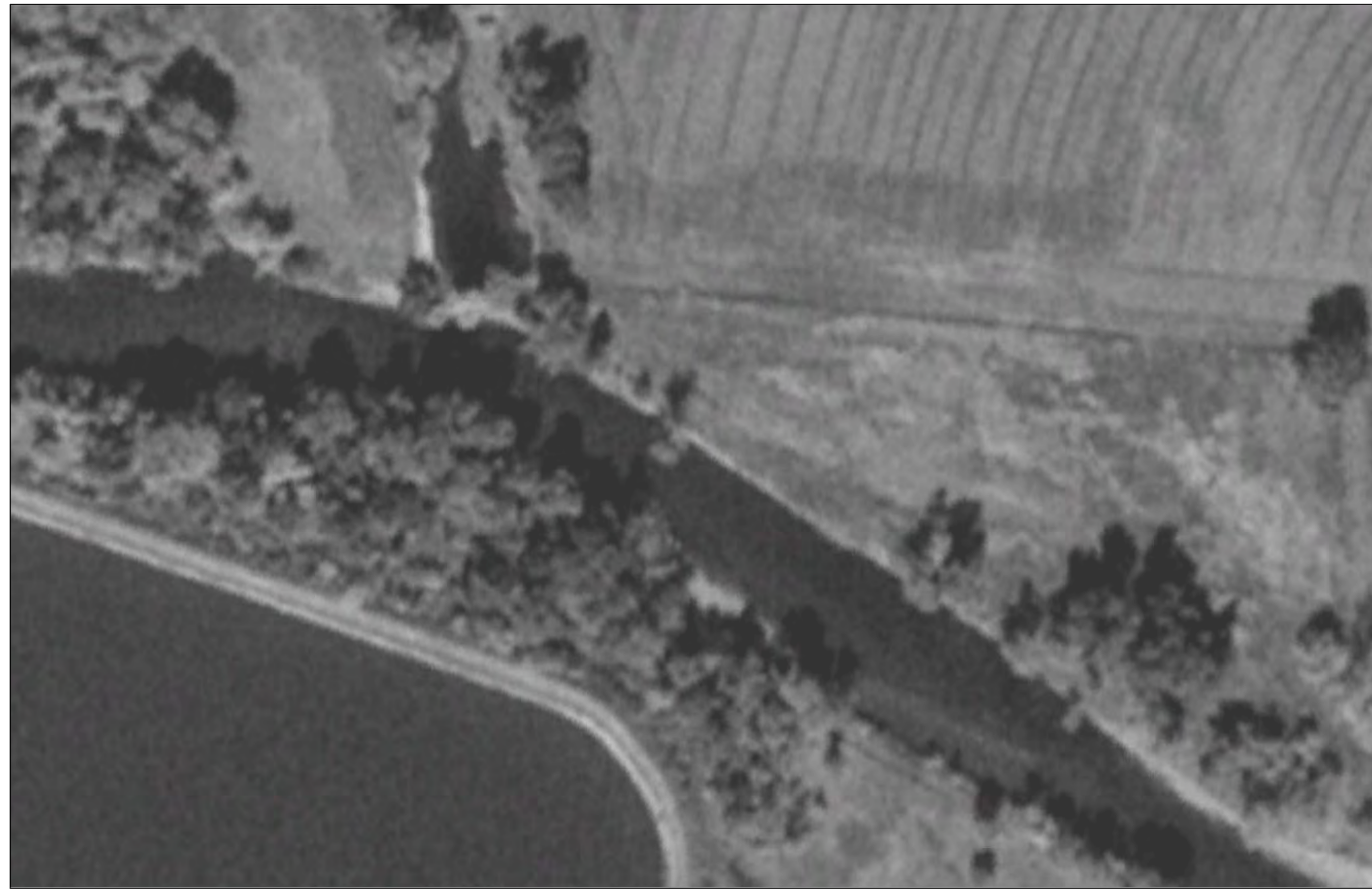
1999 AERIAL IMAGE