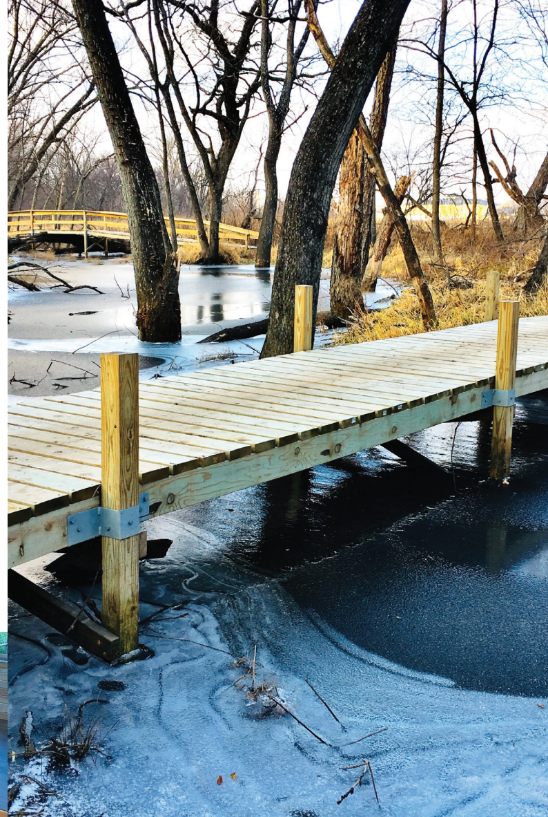
ABOVE: Trees along a Coralville greenbelt suffered mightily during the 2020 derecho, but logs from those damaged trees were locally milled into lumber and the trees returned in the form of a new boardwalk made of naturally rot resistant bur oak and hickory from where they once grew.