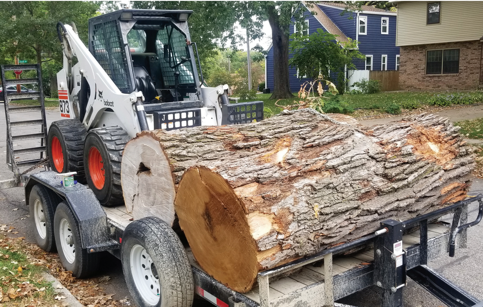
Typically destined for a shredder, neighbors asked the tree service to save these bur oak logs from a residential tree in a Des Moines neighborhood. The logs went to a portable sawmill and the lumber was returned to the same neighbors and air dried in a garage of a hobby woodworker to make keepsake furnishings for neighbors.

The demand for Iowa-produced craft beers, farmers-market-fresh fruit, vegetables and herbs expand every year and a new trend is emerging to satisfy cravings for locally milled lumber from area trees. The result is exquisite hardwoods for artisans to create handsome home goods.