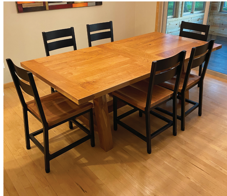
ABOVE, TOP: Woodworkers, DIYers and homeowners can find the perfect locally grown and milled craft wood for unique projects at Habitat for Humanity ReStores in Des Moines and Iowa City.