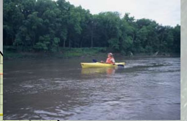
The Raccoon River in West Des Moines and Des Moines offers a tranquil greenbelt in the heart of Iowa's most urbanized area.