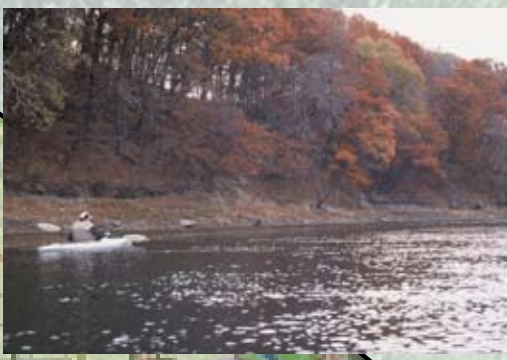
Downstream of Adel on the North Raccoon