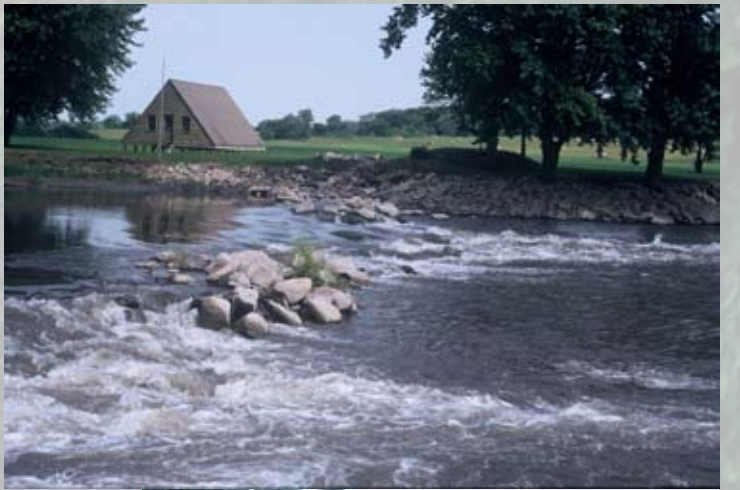
A rock dam at the Bennett Access.