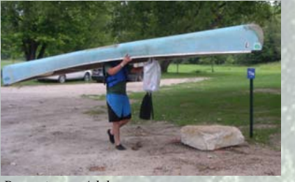
Portaging at Adel.