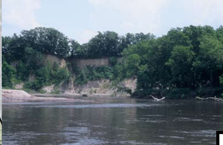
The North Raccoon's clay bluffs in Greene County.

Minor fish species present: Bullhead, smallmouth bass, flathead catfish, walleye