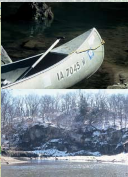
Snow-covered bluffs at the Whiterock Conservancy.