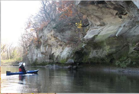
Hanging Rock on the Middle Raccoon River