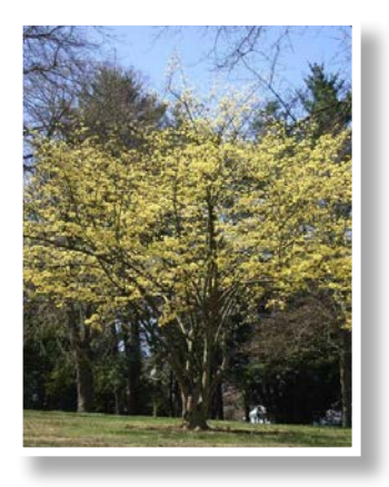
Cornelian Cherry Dogwood N Carpinus caroliniana 20-30' tall; 15-20' wide full/partial shade, alkaline/ moist/well-drained soils, slow growth rate