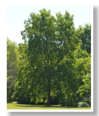
Black Walnut Juglans nigra 50-75' tall; 30-50' wide full sun, alkaline, moist, well-drained soils