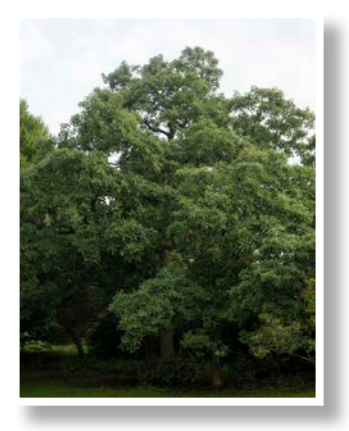
Dwarf Chinkapin Oak Quercus prinoides 20-30' tall and wide full sun, moist/welldrained soils, moderate growth rate