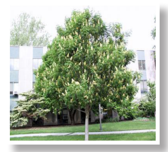
Ohio Buckeye Aesculus glabra 30-40' tall; 30-40' wide full/partial sun, wet soils, slow growing