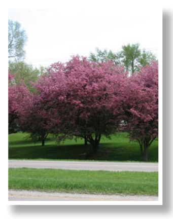
Flowering Crabapple Malus sp. 12-25' tall and wide spring flowers