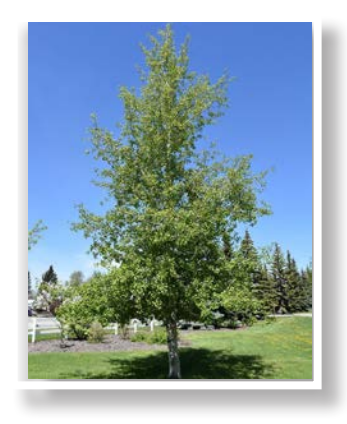
Quaking Aspen Populus tremuloides 40-50' tall; 20-30' wide full sun, fast growing