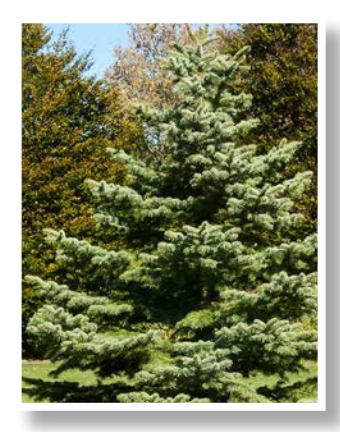
White Spruce Picea glauca 40-60' tall; 10-20' wide full sun, well-drained/ moist soils, moderate growth rate