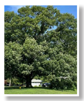
White Oak N Quercus alba 50-80' tall and wide fall color, shade, storm resistant