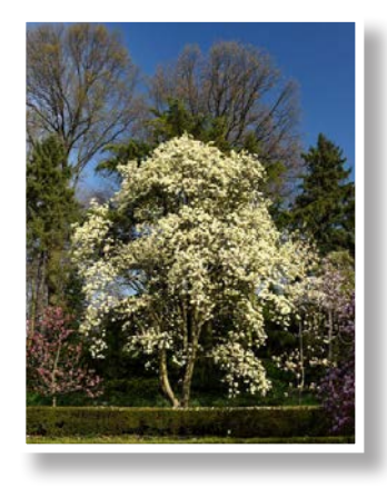
Elizabeth Magnolia 20-30' tall; 12-20' wide full sun, alkaline/moist/ well-drained soils, moderate growth rate