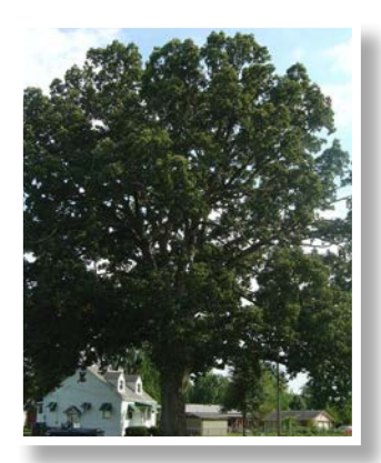
Chinkapin Oak N Quercus muehlenbergii 40-80' tall; 40-50' wide shade