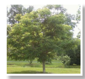
Kentucky Coffeetree N Gymnocladus dioicus 60-75' tall; 40-50'wide storm resistant, reduced raking (seedless only), shade