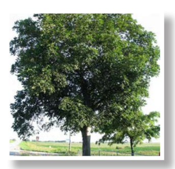
Shellbark Hickory N Carya laciniosa 75-100' tall; 50-75' wide full/partial sun, wet soils, slow growing