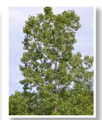
Bigtooth Aspen Populus grandidentata 75-100' tall and wide full/partial sun, wet soils, fast growing

Consider a layout to attract songbirds and other small wildlife. Clumped design will make for a very "natural" look, while providing suitably thick winter shelter. Contact your local District Forester for more information.