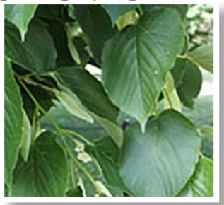
American Linden N Tilia Americana American Sentry, Front Yard 60-80' tall; 20-40' wide shade, pollinator species, wet sites, clay tolerant