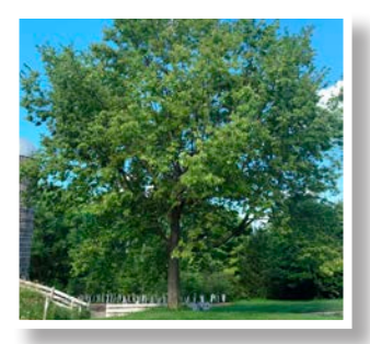
Hackberry N Celtis occidentalis 40-60' tall and wide shade, wet sites, dry sites, pollinator & songbird species