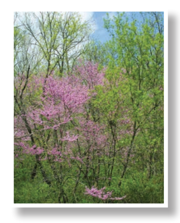
Eastern Redbud N Cercis canadensis 20-30' tall; 25-35' wide spring flowers, storm resistant, small space, under powerlines, single or multi-stemmed

Blue Beech (Hornbeam) N Carpinus caroliniana 20-30' tall and wide fall color, small space, under powerlines, storm resistant, clay tolerant