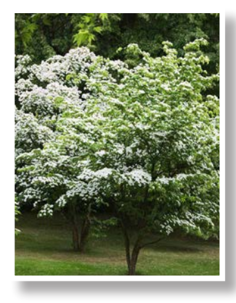
Kousa Dogwood Cornus Kousa 20-30' tall; 20-30'wide full/partial shade, acidic/ moist/well-drained soils, slow growth rate