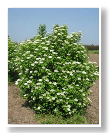
Nannyberry N Viburnum lentago 15-25' tall and wide full/partial shade, alkaline/moist/welldrained soils, slow growth rate

Bladdernut N Staphylea trifolia 10-15' tall; 10-20' wide partial/full shade, moist/well-drained soil, moderate growth rate