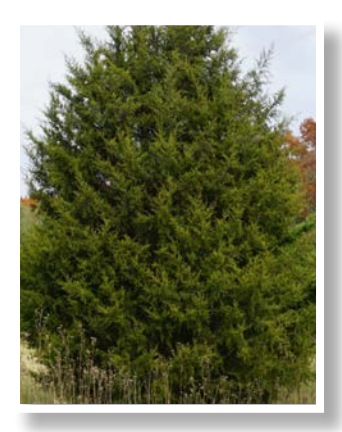
Eastern Redcedar Juniperus virginiana 30-40' tall; 20-30' wide full/partial sun, welldrained/moist/sandy soils, moderate growth rate