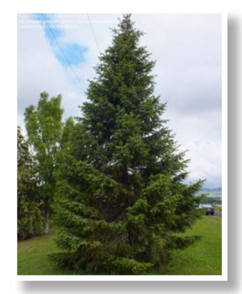
Serbian Spruce Picea omorika 40-60' tall; 15-20' wide full sun, well-drained/ moist soils, moderate growth rate