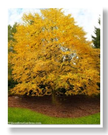
Yellow Birch Betula alleghaniensis 60-75' tall; 60-75'wide full sun, acidic/moist/ well-drained soil, moderate growth rate