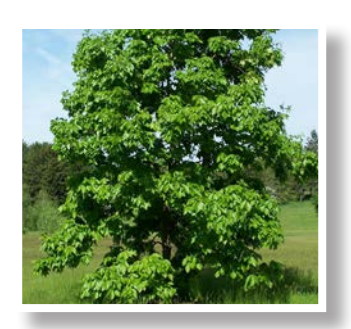
Shagbark Hickory N Carya ovata 70-90' tall; 50-70' wide shade, clay tolerant, storm resistant