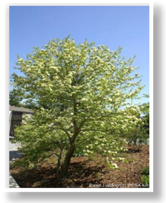
Blackhaw Viburnum N Viburnum prunifolium 10-15' tall; 5-10'wide partial/full shade, moist/well-drained soil, moderate growth rate