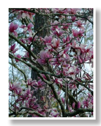
Saucer Magnolia Magnolia X soulangeana 20-30' tall and wide spring flower, hardy to zone 5 only