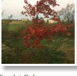
Scarlet Oak Quercus coccinea 70-75' tall; 40-50'wide fall color, shade