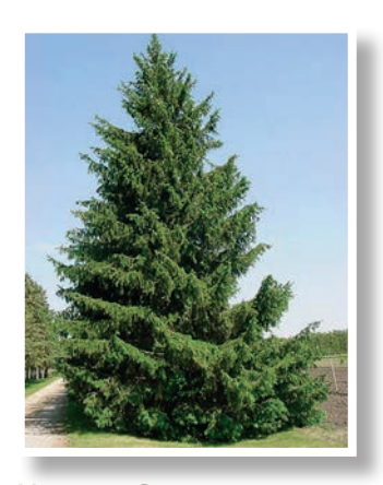
Norway Spruce Picea abies 40-60' tall; 25-30' wide shade, clay tolerant, windbreak