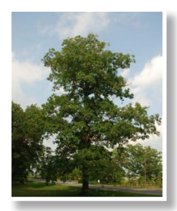
Pignut Hickory Carya glabra 50-60' tall; 25-35' wide full sun, dry, moist, well-drained soils, slow growing