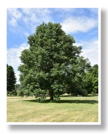
Swamp White Oak Quercus bicolor 50-60' tall; 50-60' wide full sun, moist/acidic/ well drained soils, moderate growth rate