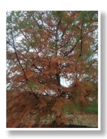
Dawn Redwood Metasequioia glyptostroboides 70-100' tall; 25' wide shade, fall color, fast growing, hardy to zone 5 only