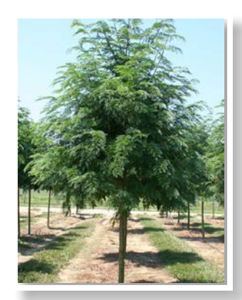
Thornless Honeylocust Gleditsia triacanthos 30-70' tall; 30-70' wide full sun, moist/welldrained soils, fast growing