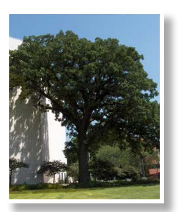
Bur Oak N Quercus macrocarpa 70-80' tall and wide shade, storm resistant, clay sites, wet sites

Black Oak N Quercus velutina 50-60' tall and wide fall color, shade, clay sites