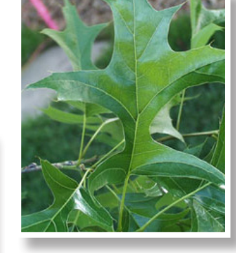
Northern Pin Oak N Quercus ellipsoidalis 60-80' tall; 20-40' wide fall color, shade, high ph soils