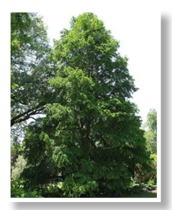
Katsura Tree Cercidiphyllum 40-60' tall; 30-60' wide full sun, wet soils, moderate growing