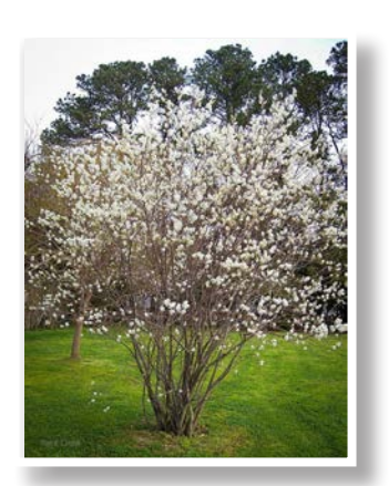
Serviceberry N Amelanchier 15-25' tall and wide shade/partial shade, moist/well-drained soils, moderate growth rate