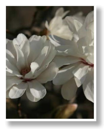
Loebner Magnolia Magnolia X loebneri Leonard Messel, Merrill, Ballerina 20-30' tall and wide spring flowers, typically multi-stemmed