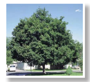
London Planetree Platanus X acerfolia Exclamation 70-100' tall; 65- 80' wide shade, wet sites, fast growing