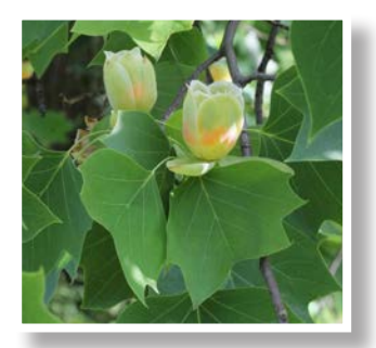
Tuliptree Liriodendron tulipfera 70-90' tall; 35-50' wide shade, wet sites, fast growing, spring flowers