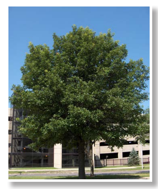
Swamp White Oak N Quercus bicolor 50-60' tall and wide shade, storm resistant, clay sites, wet sites

rees have a big impact on the character of a neighborhood, and a diverse mix of trees is necessary for maintaining a healthy and resilient community forest. Designed for both homeowners and city staff, this publication helps guide yard and street planting by matching species needs with site characteristics. By planting a wide variety of species well-suited for the site, you can help ensure a community's tree canopy is a valuable resource for the future.