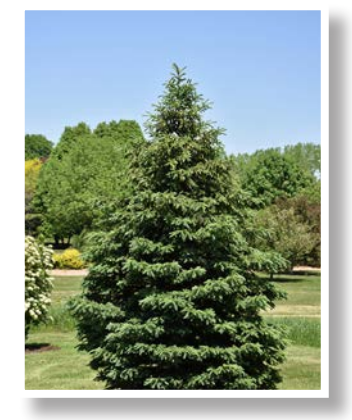
Black Hills Spruce Picea glauca 40-60' tall; 10-20' wide full sun, well-drained/ moist soils, moderate growth rate