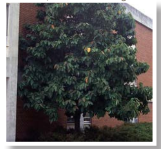
Cucumbertree Magnolia Magnolia acuminata 50-80' tall and wide shade, spring flowers