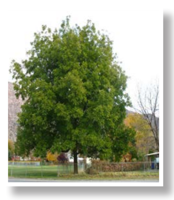
Northern Pecan Carya illinoinensis 75-100' tall; 40-70'wide full sun, rich soils, slow growing