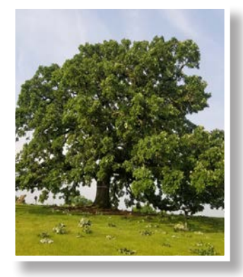
Heritage Oak Quercus x macdaniellii 60-80' tall; 40-50'wide full sun, moist, welldrained soils