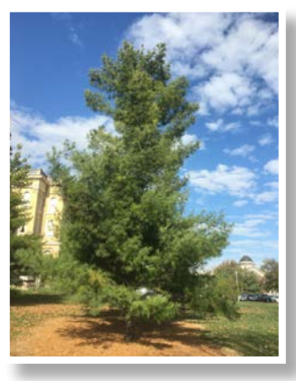
White Pine N Pinus strobus 50-80' tall; 20-40' wide shade, clay tolerant