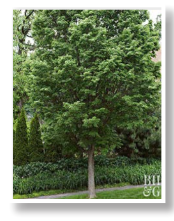
Dwarf Hackberry Celtis tenuifolia 20-30' tall; 15-25' wide shade/partial shade, moist/well-drained soils, slow growth rate