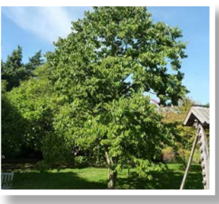
Common Persimmon Diospyros virginiana 30-60' tall; 25-35' wide full/partial sun, moist, well-drained soils, moderate growth rate