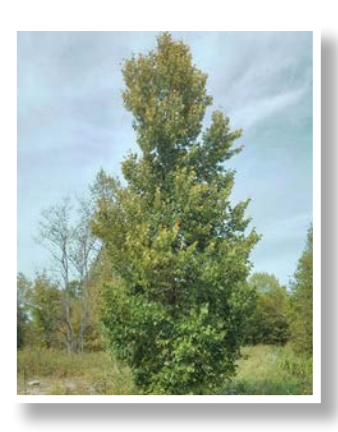
Rock Elm Ulmus thomasii 80-100' tall; 70-90 wide full sun, moist/welldrained soils, moderate growth rate