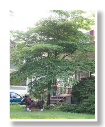
Pagoda Dogwood N Cornus alternifolia 15-25' tall and wide spring flowers, pollinator and songbird species, small space, under powerlines, requires partial to full shade