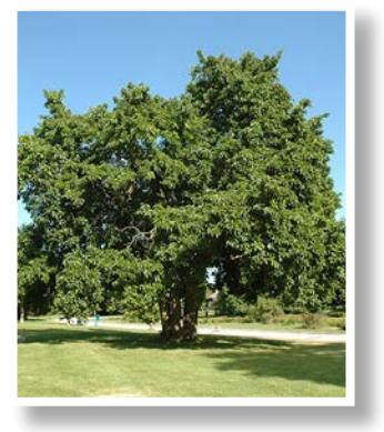
Osage Orange Maclura pomifera 30-40' tall; 20-40' wide full sun, moist, welldrained soils, moderate growth rate