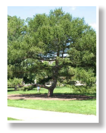
European Larch Larix decidua 70-75' tall; 25-30' wide fall color, clay sites