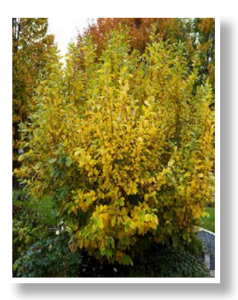
Witch Hazel N Hamamelis virginiana 15-20' tall; and wide full/partial shade, alkaline/moist/welldrained soils, slow growth rate