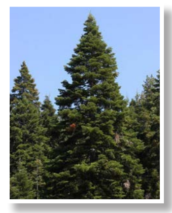
Concolor Fir Abies concolor 40-70' tall; 20-30' wide shade, clay tolerant