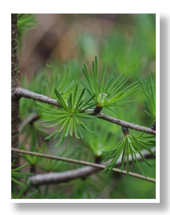
Tamarack Larix laricina Glenleven 30-50' tall; 20-35' wide clay tolerant, fall color