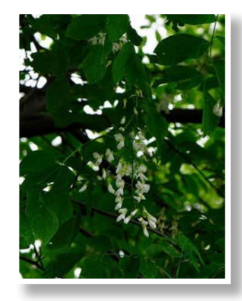
Yellowwood Cladrastis kentukea 30-50' tall; 40-55'wide spring flowers, fall color,

Ironwood (Hophornbeam) N Ostrya virginiana 25-40' tall; 20-40' wide small space, storm resistant