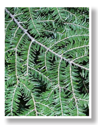
Eastern Hemlock Tsuga canadensis 40-70' tall; 25-35' wide shade, storm resistant