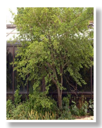
Eastern Wahoo N Euonymus atropurpureus 15-20' tall and wide full/partial shade, alkaline/ moist/well-drained soils, slow growth rate