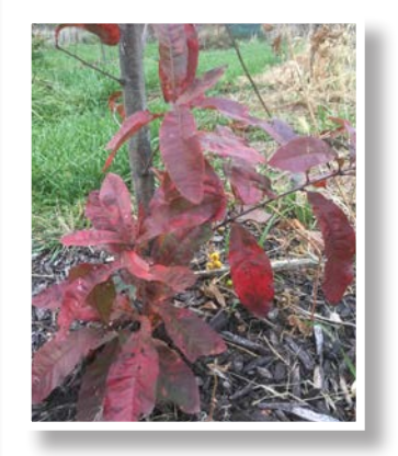
Shingle Oak N Quercus imbricaria 50-80' tall and wide fall color, shade, windbreak