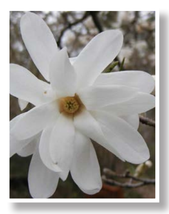
Star Magnolia Magnolia stellata 15-20' tall; 40-50'wide spring flowers, typically multi-stemmed