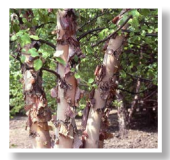
River Birch N Betula nigra 40-60' tall and wide fall color, shade, clay sites, wet sites, single or multi-stemmed