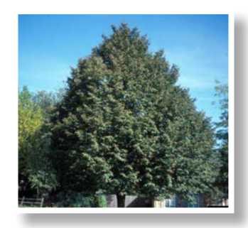
Littleleaf Linden Tilia cordata Glenleven 60-70' tall; 30-40' wide shade, clay tolerant, storm resistant