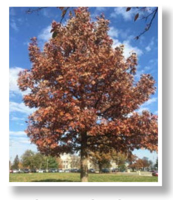
Northern Red Oak N Quercus rubra 60-75' tall and wide fall color, shade