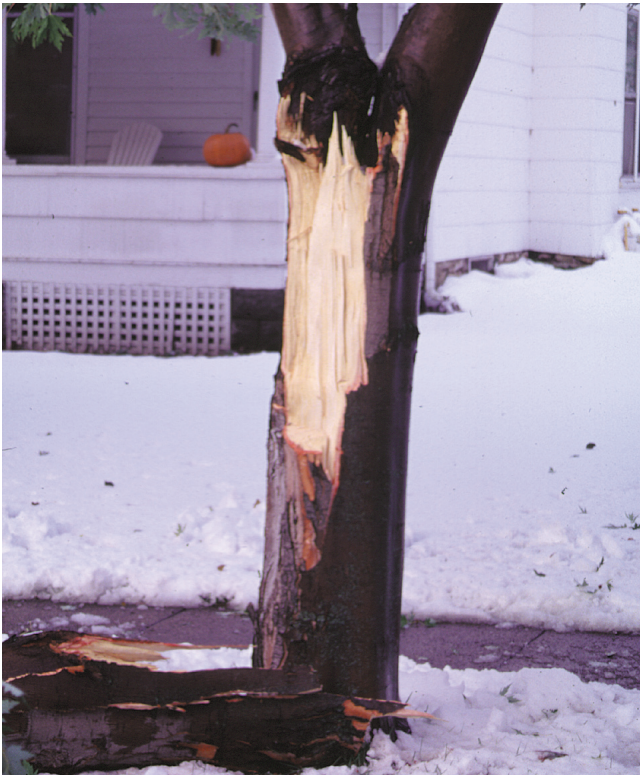
Exposure of a large area of wood on the main trunk makes recovery difficult and may make removal necessary.

Carefully inspect the tree for hidden damage. Identify cracks in the trunk or in large limbs. To reduce safety hazards, it is important to find hidden damage before repair work begins.