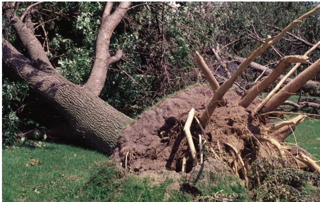
Storm-damaged tree after summer wind storm.

Ice, snow, and wind can damage all species and ages of trees. The dynamic force of wind may whip trees back and forth or twist them causing branches or trunks to fail. Ice loading—and to a lesser extent, snow loading—results in weight accumulation on tree limbs resulting in branch failure. In fact, accumulations of ice can increase the branch weight of trees by 30 times or more. After damaging storms, injured trees should be examined carefully and treated appropriately.