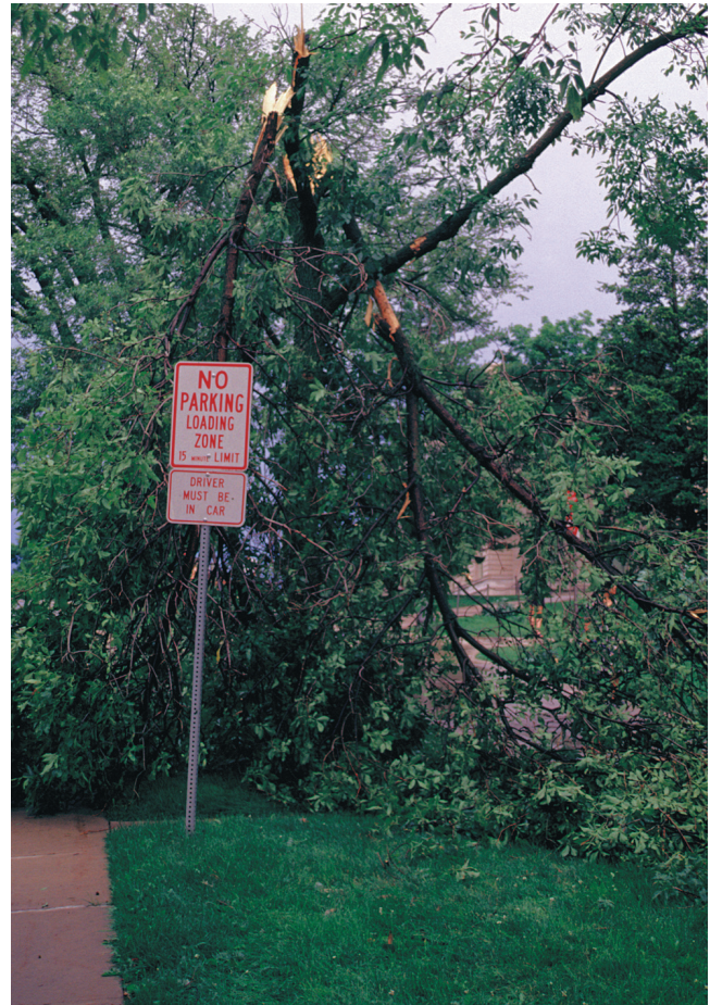
Severely damaged tops make trees a poor risk.

Any type of major injury may reduce the useful life of a tree. Such wounding can provide an entrance point for decay fungi or insects. Damage to trees also may reduce or destroy their intended function or severely disfigure the tree and ruin the appearance. The decision to retain or remove those trees depends on the individual situation and no specific guidelines can be offered.