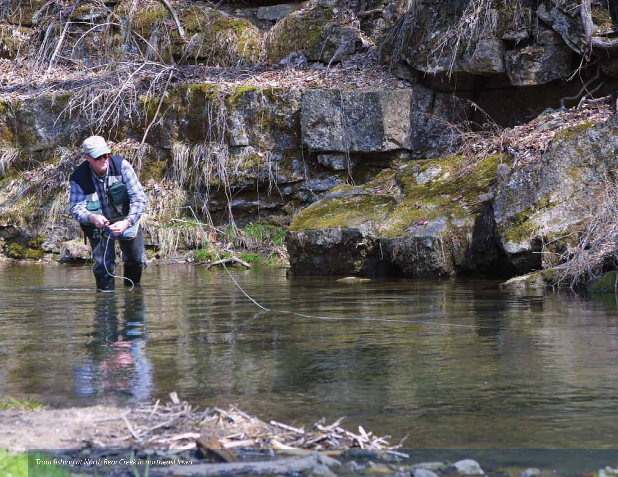
Trout fishing at North Bear Creek in northeast Iowa.