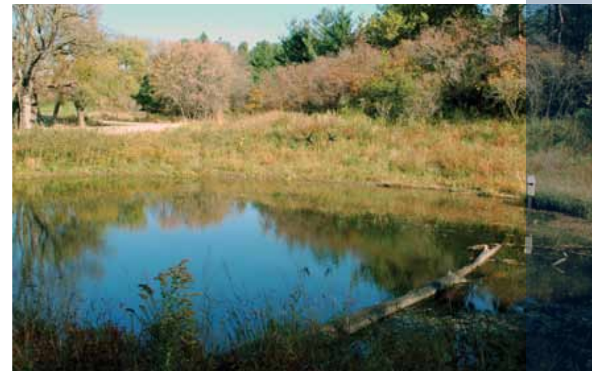
Wood ducks enjoy a new retention pond, which also catches and filters runoff.

Meanwhile, the Jones County Nature Center in Central Park has added an interactive classroom and lab area, technological updates and more. Out in Central Park, new walkways and sidewalks were installed, and the Bowstring Arch Bridge was repaired. With this good start, Central Park and its star attractions are poised to provide visitors even better experiences in the coming years.