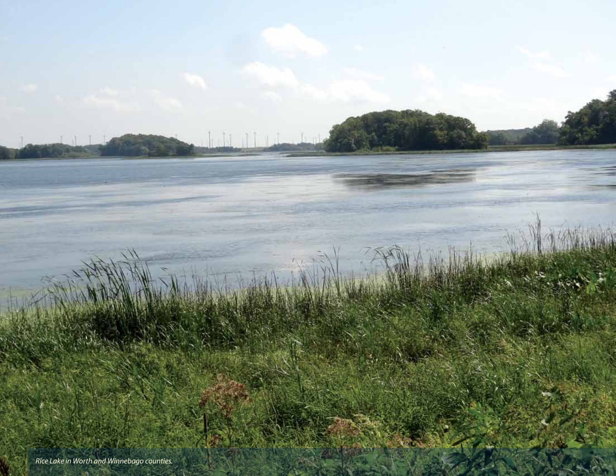
Rice Lake in Worth and Winnebago counties.