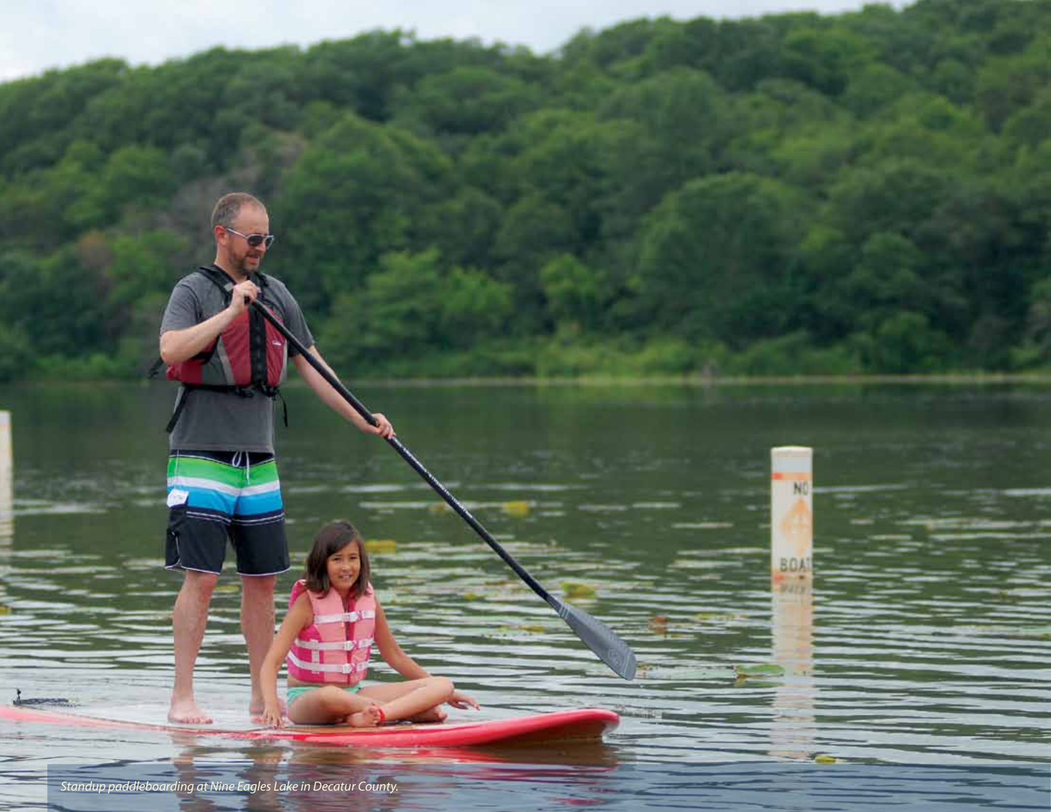
Standup paddleboarding at Nine Eagles Lake in Decatur County.