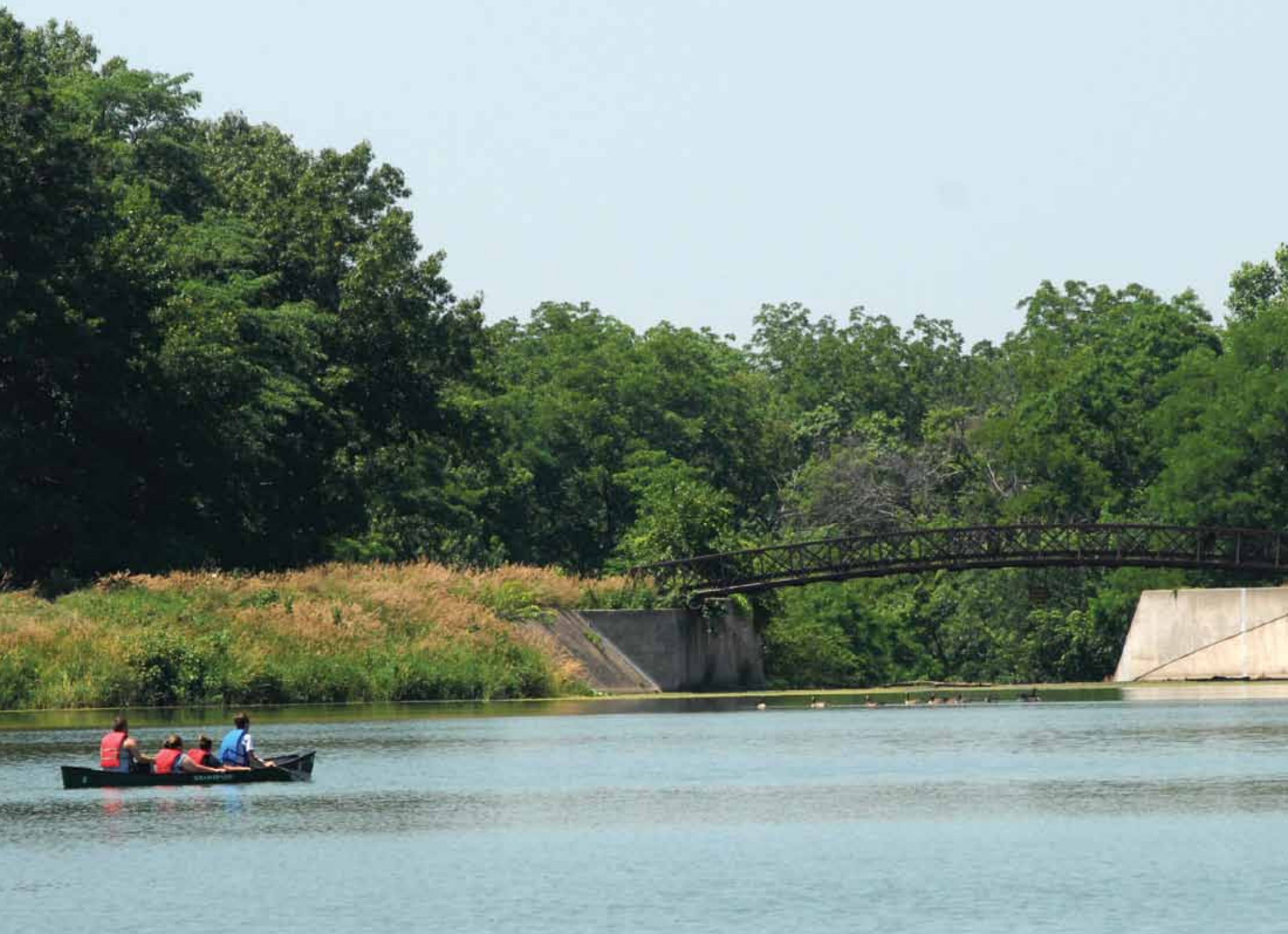
Lake Ahquabi in Warren County.