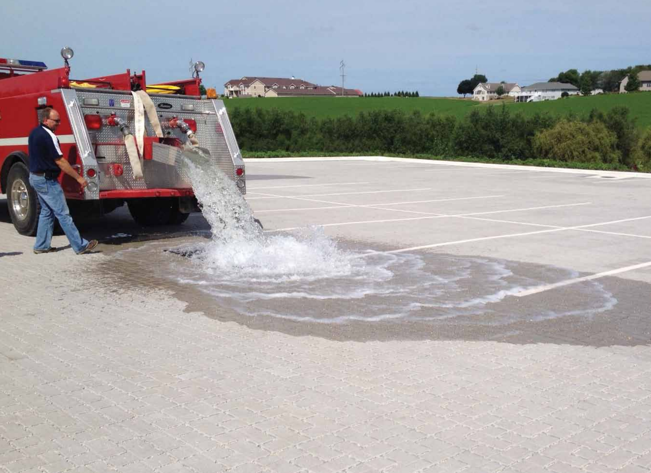
The Monona Fire Department lets loose 2,000 gallons of water to demonstrate how the pervious parking lot will soak up the water rather than letting it run off.