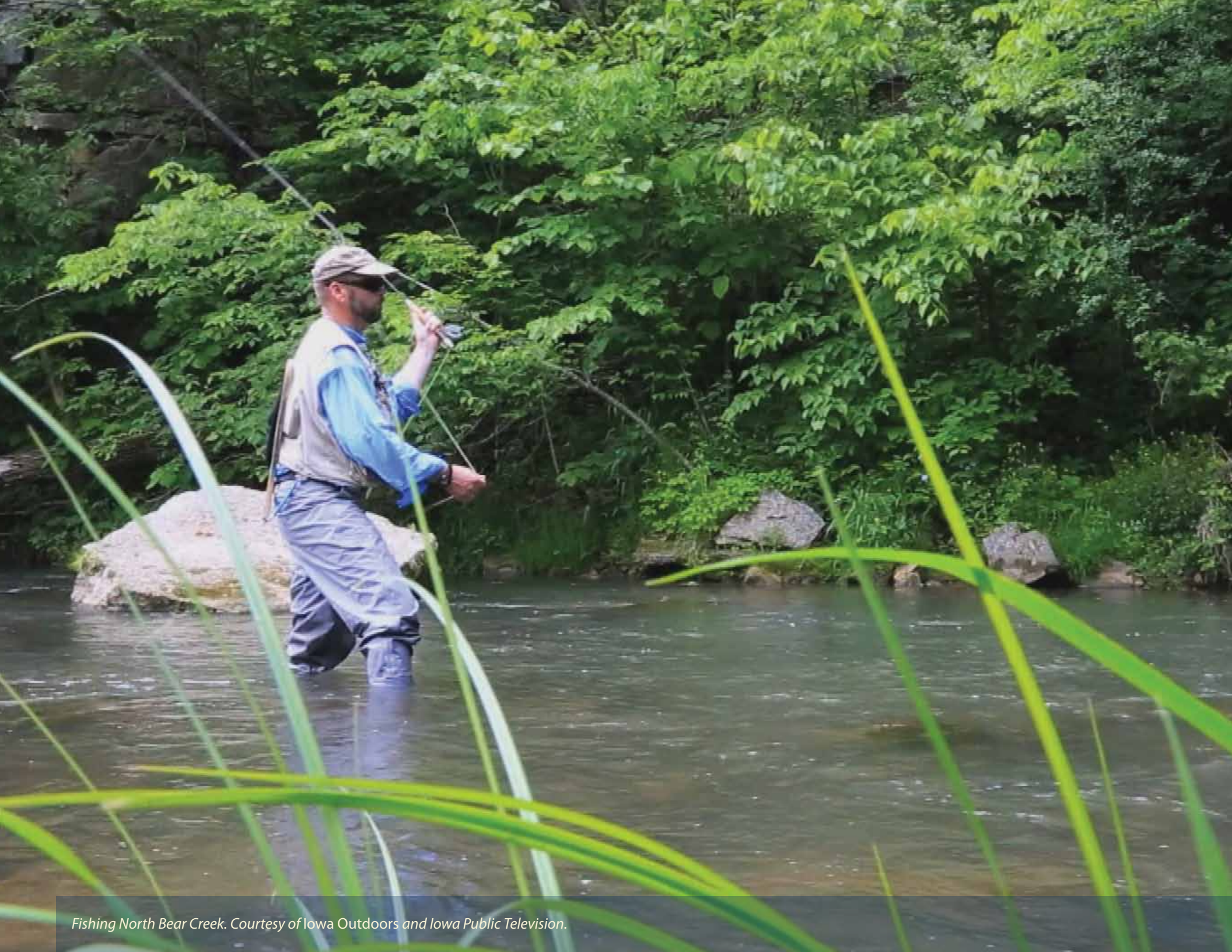
Fishing North Bear Creek.