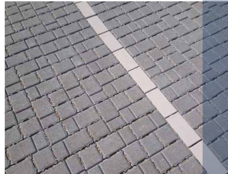
Pervious pavers allow water to soak through the parking lot. Colored pavers mean no future line painting is needed either.

The total amount invested in the first two years is projected to be $25 million. Sponsored project applications are taken in March and September.