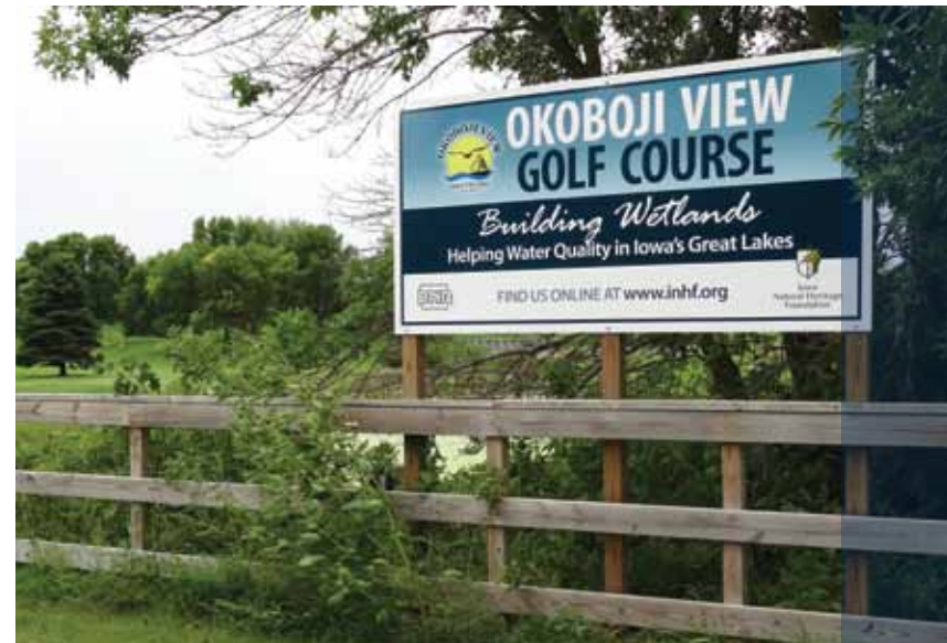
Wetlands at this golf course help protect the Iowa Great Lakes.

This was a very complex project, LaRue says. It involved a series of acquisitions and easements, plus design and construction while