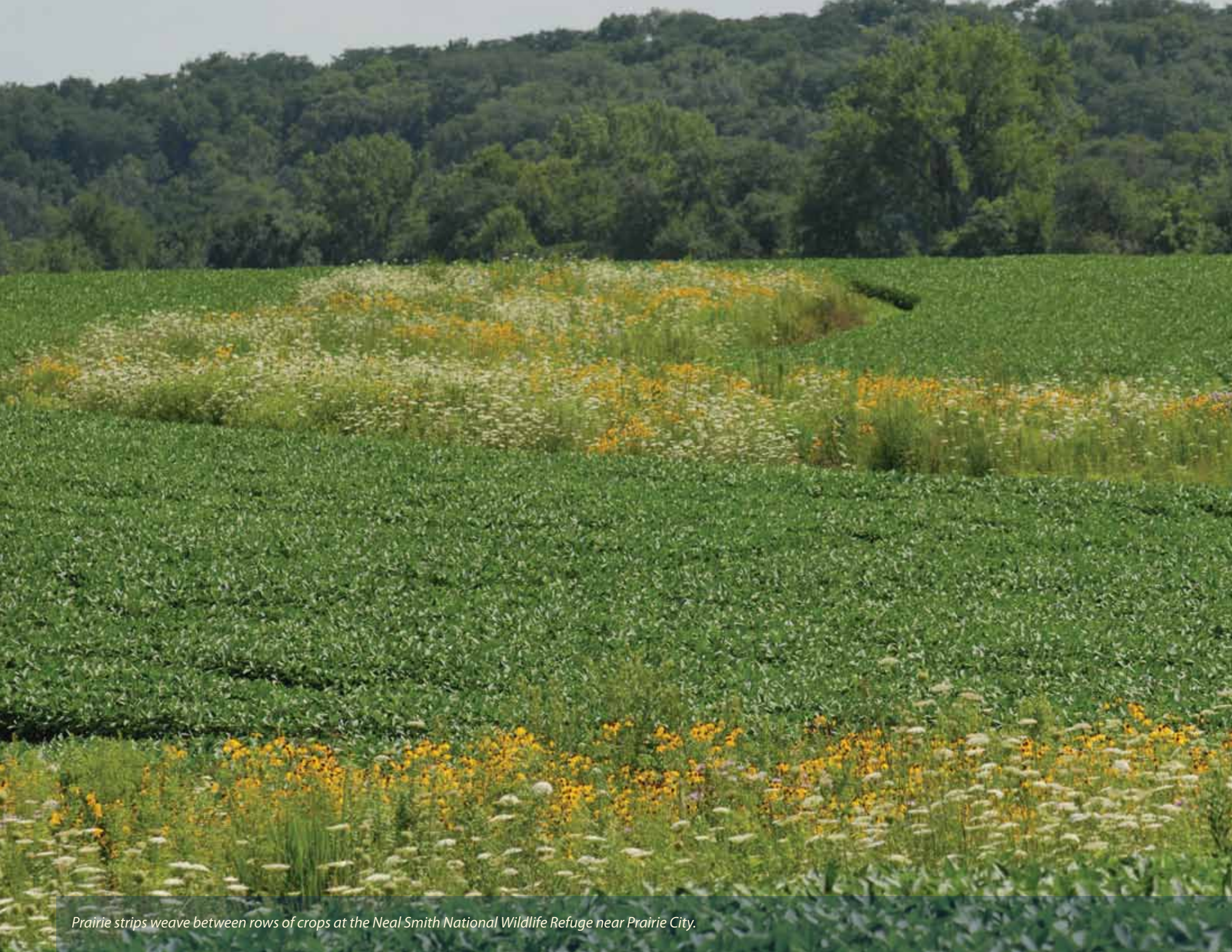
Prairie strips weave between rows of crops at the Neal Smith National Wildlife Refuge near Prairie City.