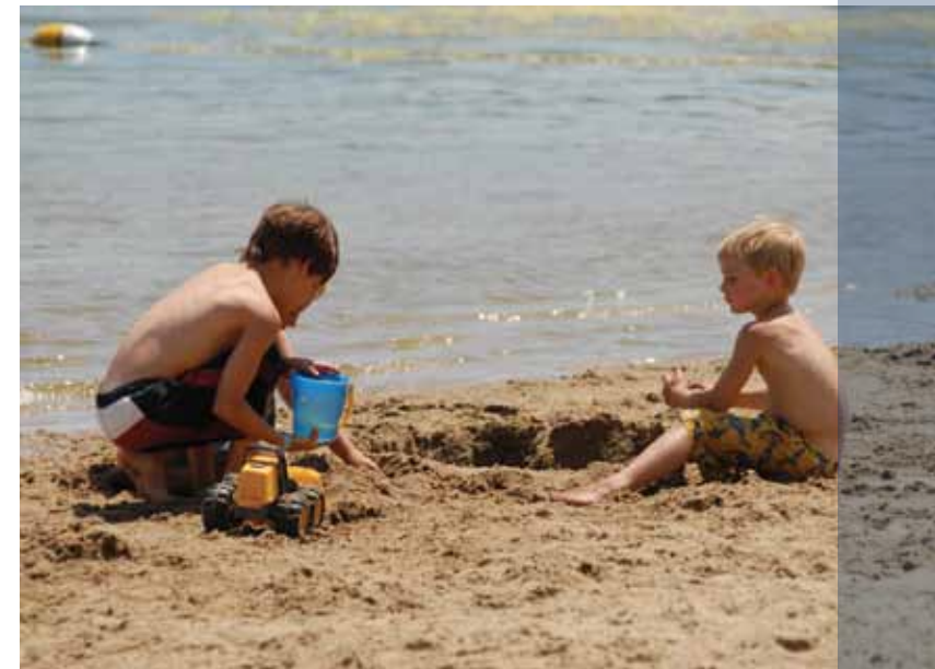
Enjoying the beach at Viking Lake State Park.