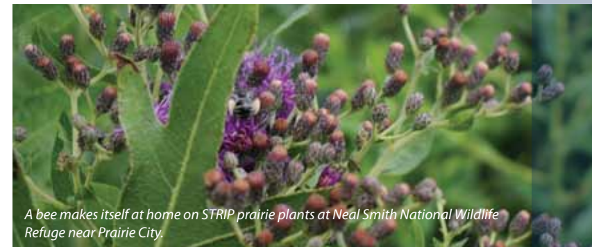
A bee makes itself at home on STRIP prairie plants at Neal Smith National Wildlife Refuge near Prairie City.