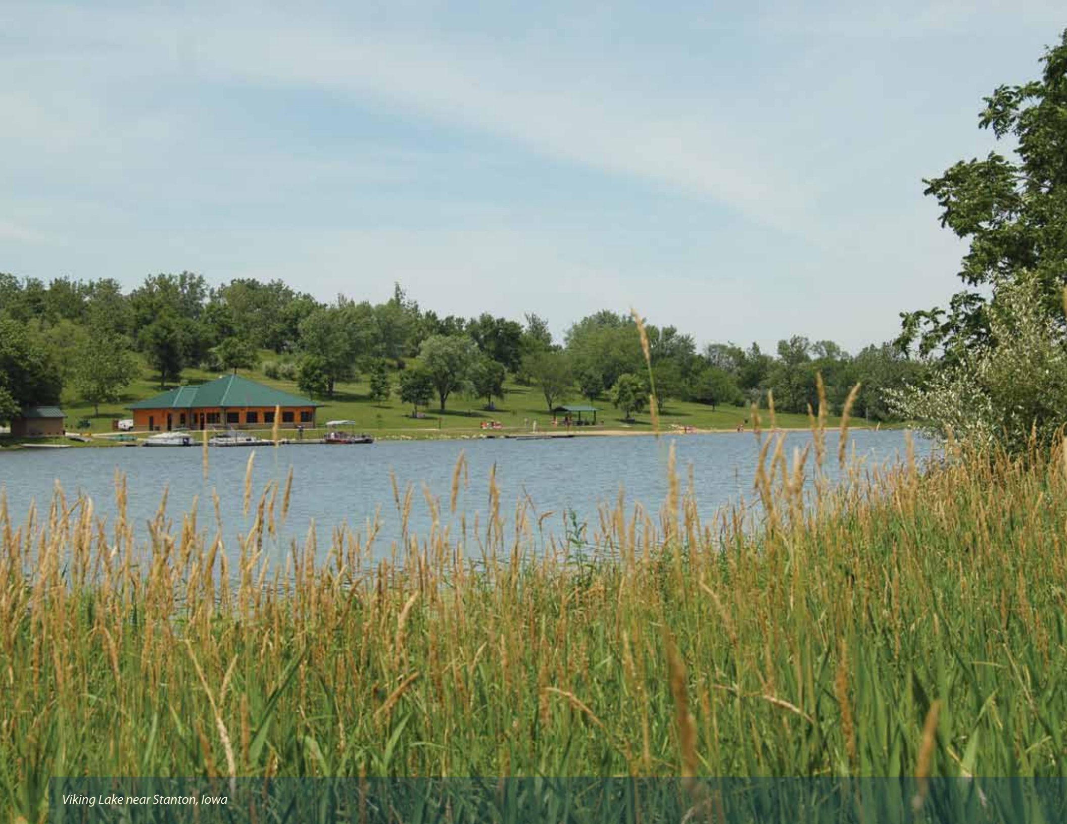
Viking Lake near Stanton, Iowa