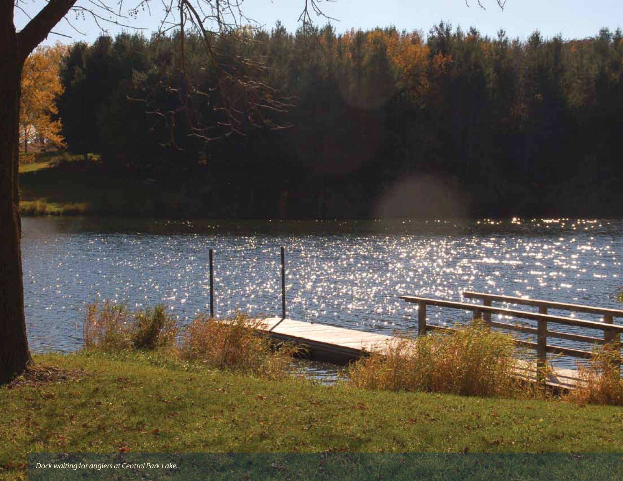
Dock waiting for anglers at Central Park Lake.