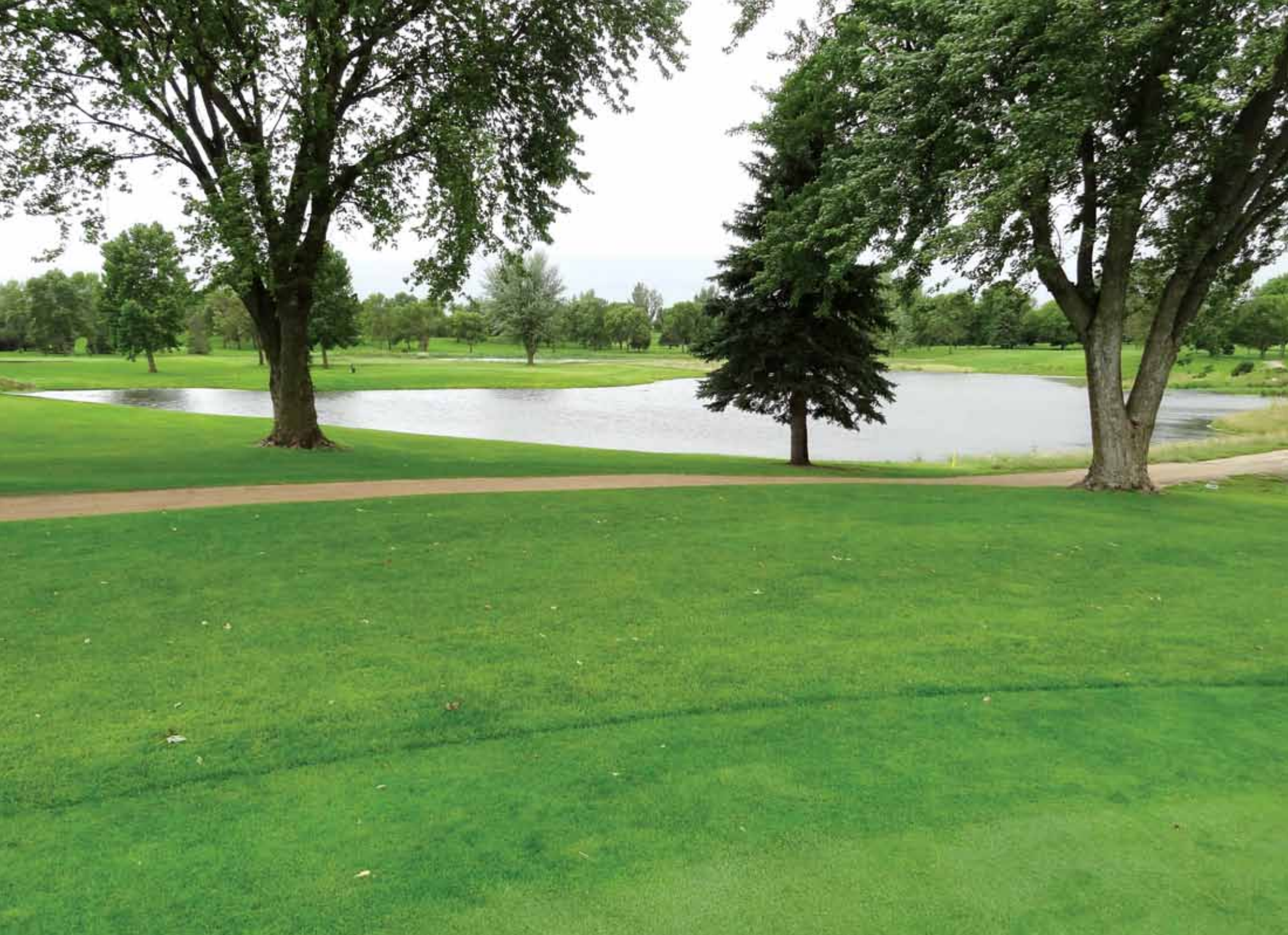
A wetland complex on a local golf course helps protect West Okoboji Lake.