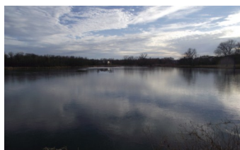
Easter Lake Sunset—Winter 2012

EA was responsible for producing the Plan documents, which included an implementation and public outreach plan and conceptual level design concepts for improvement projects.