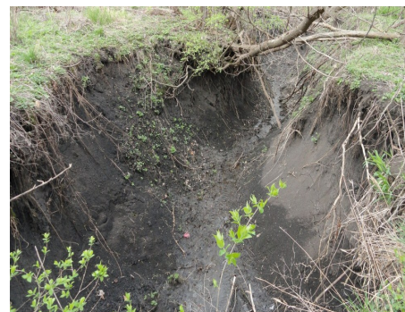
Stream erosion contributes sediment to the lake.

For more information contact the project sponsors or Visit the project website at www.easterlakewatershed.wordpress.com