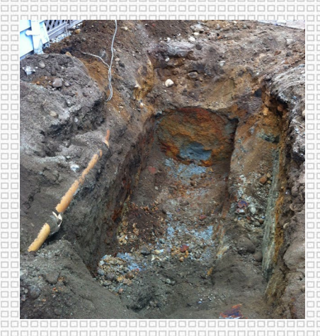
Oil/Fuel tank removal