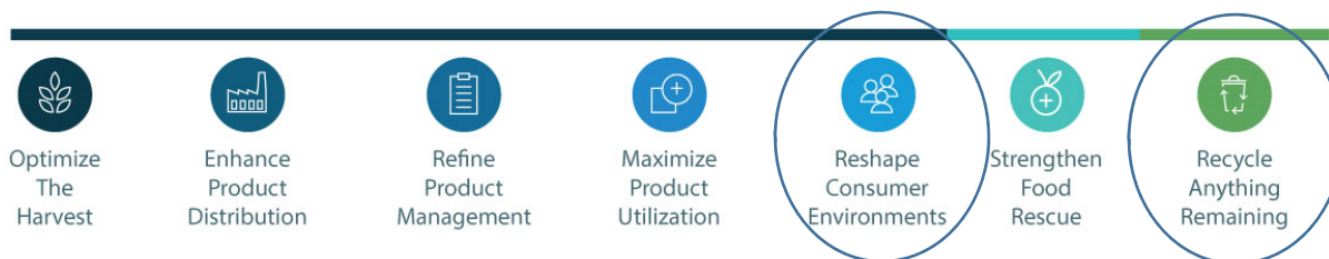
Figure 1 – ReFED Key Action Areas

The consulting team recommended starting with Recycle Anything Remaining and Reshape Consumer Environments as ReFED data shows that these two action areas have the greatest potential to divert food waste from the landfill. For two of the key action items, Subcommittee members discussed implementation of identified strategies. The implementation strategies identified by Subcommittee members are located in Attachment B.