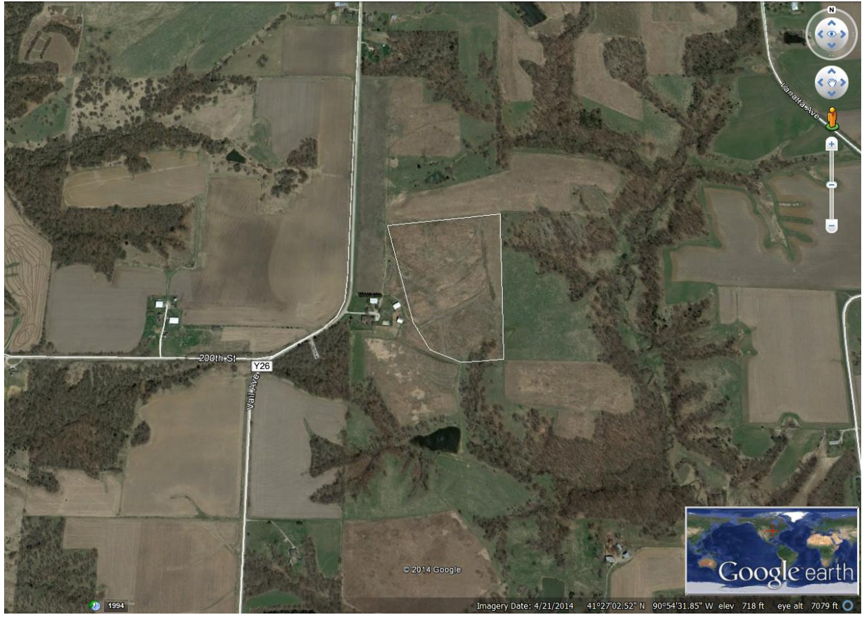
Site Photo 2014