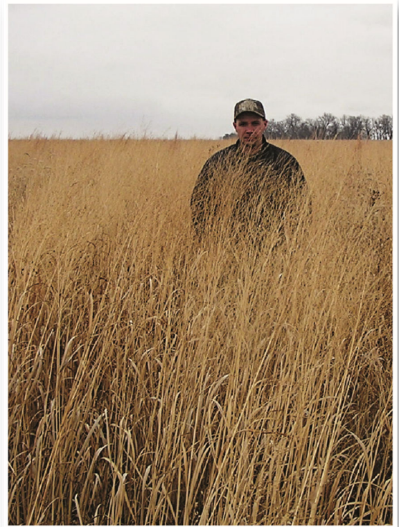
Thick stands of warm season grasses or shrubs provide the cover pheasants need during snowy winters.

Other grassland birds and species, especially pollinators, will benefit, too. Most of all, Iowa's natural resources will benefit from reduced erosion and improved water quality. Eligible producers can sign up at their local USDA Farm Service Agency .