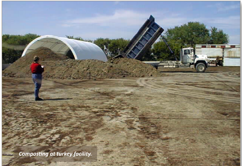
Composting at turkey facility.

Poultry producers can use this guide when they have a disease outbreak or are planning for a potential outbreak. Look for these sections: the five carcass disposal options in Iowa, disposal of potentially contaminated waste, supplies, equipment, and the disposal of wastewater generated when decontaminating equipment, vehicles and staff.