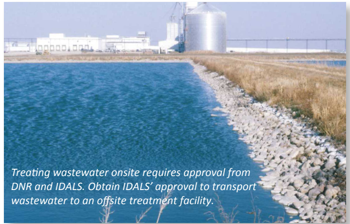
Treating wastewater onsite requires approval from DNR and IDALS. Obtain IDALS' approval to transport wastewater to an offsite treatment facility.

While sending carcasses to a rendering plant is approved, the facility must be willing to accept the carcasses. Also strict biosecurity measures must be met at the farm and rendering facility and IDALS must approve moving carcasses off-site. Obtain approval from the DNR and IDALS for the final disposal of the rendered product before choosing this option.