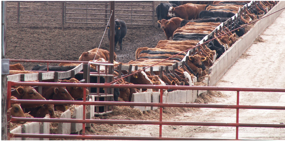
Beef cattle on central Iowa open lot.

ENVIRONMENTAL SERVICES DIVISION | WWW.IOWADNR.GOV