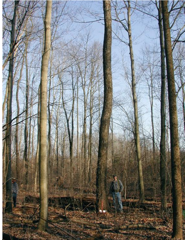
A Rare Mature Butternut in a Forested Area.

In 1990 Iowa had an estimated 1.4 million butternut trees; by 2008 an estimated 84,000 trees remain (94% drop). There has not been any effort to date to determine how many of the 84,000 or so remaining trees are native butternut. There are some physical characteristics that can be used to distinguish between a native butternut and a hybrid, but it is usually difficult when looking up into the canopy of a mature tree in a forest setting. The trees we are finding in Iowa are being tested using DNA analysis to determine which trees are hybrids and which are native.