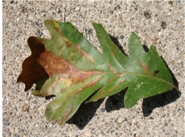
Bur oak leaf infected with BOB

Recent observations by Iowa Department of Natural Resources (IDNR) foresters and investigations by Iowa State University (ISU) have identified a serious threat to bur oak. Bur oak blight (BOB; Tubakia iowensis ) is a disease that shows symptoms of v-shaped brown discoloration of leaves and browning of veins (see picture to the right). Unlike other European and Asian Tubakia spp. that are endophytes, causing minor leaf spotting, BOB can cause severe defoliation that can lead to mortality of branches or entire trees.