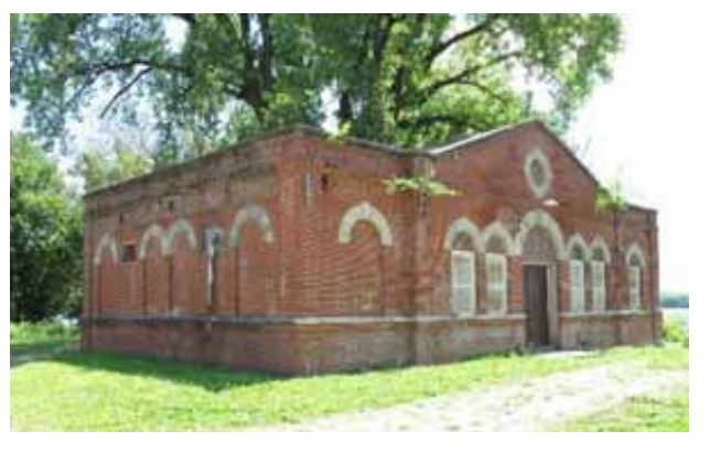
2021 image of Fairport Biological Station Pumphouse

FFFH goals include fund raising to support construction of an educational pavilion that will educate the public on the rich history of the Fairport Fish Hatchery. In addition to educational opportunities, the pavilion and trails will promote eco-tourism in the region. FFFH is also hopeful the Great River Road Commission will officially designate the fish hatchery as a Historic Interpretive Center. This designation, coupled with visits by students of all ages and tourists on three cross-country bike trails will elevate the hatchery to a premier destination stop in Muscatine County, The idyllic setting provides a beautiful backdrop for teaching history, ecology, and conservation.